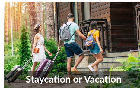
Staycation or Vacation

Start planning for the holiday weekend with savings on everything you need for your day in the sun including: